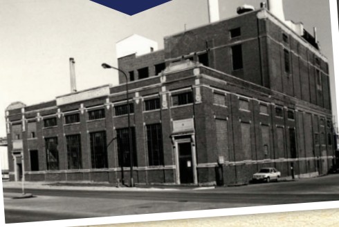
The Broadway Plant was constructed in 1916.