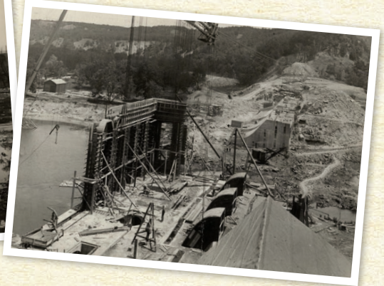
The Lake Zumbro Hydroelectric Dam was designed by Hugh L. Cooper with construction beginning in 1917. It was completed and operational in November of 1919. The facility consists of a powerhouse and a 440-foot spillway across the Zumbro River. Today, the dam can produce a maximum of 2.8 megawatts per hour.