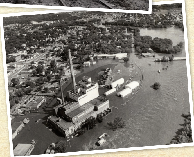
An aerial shot of SLP during the flood of 1978.