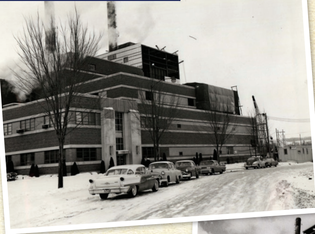
The addition being built onto the north side of the Silver Lake Plant (SLP) in October of 1968.