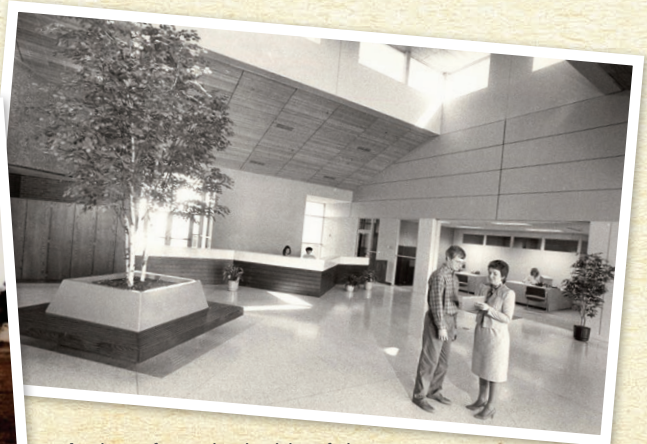
A photo from the inside of the Service Center lobby circa 1990.