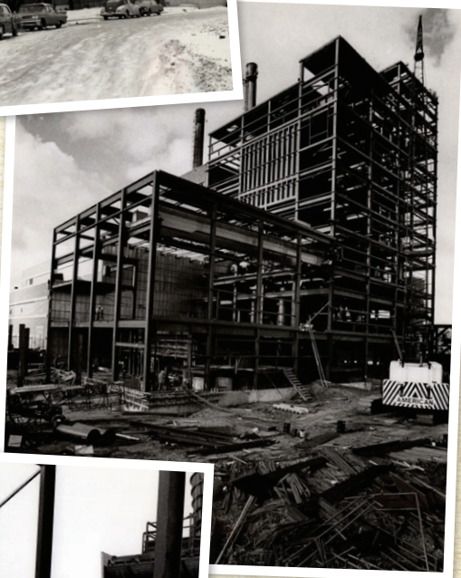
The construction along the northeast side of SLP to accommodate the addition of Unit #3 in 1961.