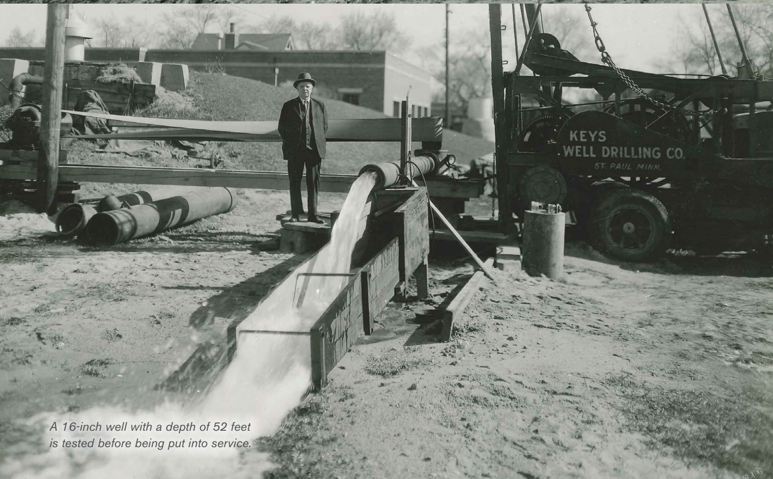
A 16-inch well with a depth of 52 feet is tested before being put into service.