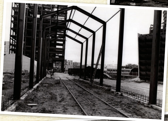
The thaw shed for railroad cars filled with frozen coal being built in 1968.