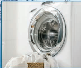
Clothes Washers and Washer/Dryer Combinations – $25 (electric rebates also available)