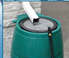
Rain Barrels – $10