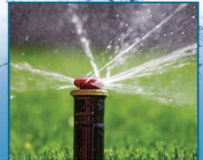
Weather-Based Irrigation Controllers – up to $75