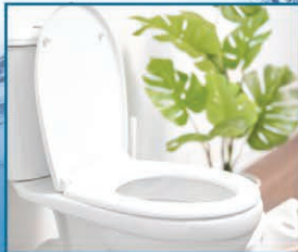
High Efficiency Toilets – $25