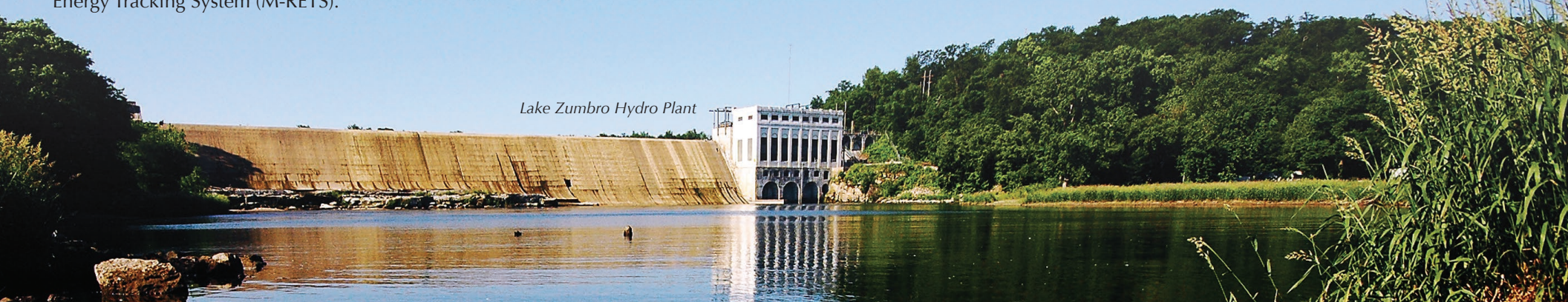
Lake Zumbro Hydro Plant

You have the option of choosing either a monthly or one-time charge on your utility bill. Don't know your annual energy usage? Contact RPU Customer Care at 507-280-1500.