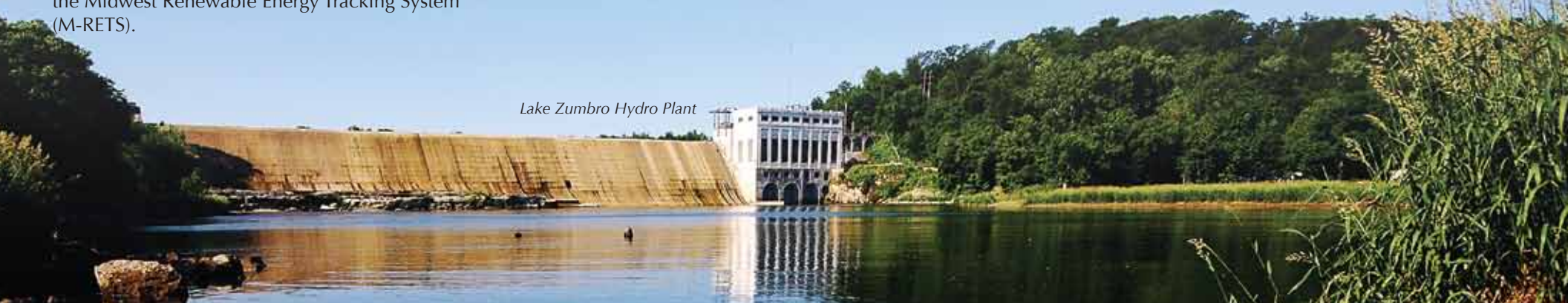
Lake Zumbro Hydro Plant

You have the option of choosing either a monthly or one-time charge on your utility bill. Don't know your annual energy usage? Contact Customer Relations at 507.280.1500.