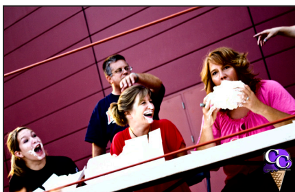
Celebrities chow down

Just how much ice cream does it take to feed the hungry attendees of the PossAbilities annual Ice Cream Social? We lost count of how much chocolate, vanilla and mint ice cream was supplied by Kemp's for the event held June 18 at our new location of Mayo Park. But we can report this – volunteers were elbow-deep in ice cream freezers for the entire night!