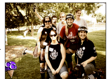
Roller Girls volunteers

First-time volunteers from the Children's Museum of Rochester had a blast providing activities and crafts for the kids. "It is great to be out in the community helping another nonprofit organization and everything goes to a great cause!" explained one volunteer. The Ice Cream Social is not only a fundraiser for PossAbilities but also facilitates fellowship among clients, their families and the general public.