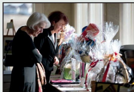
Guests had an opportunity to bid on over 50 decorated baskets.