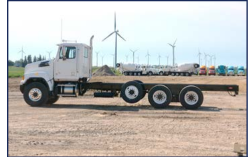
2018 WESTERN STAR 4700SF BridgeKing® Chassis Specs

Engine: DD13-410 Trans: 16909ALL Ratio: RT46-160/4.56 Susp: Hendrickson Pusher: Yes W.B: 248" Color: White