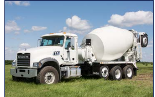
2017 MACK GU713 11 Yd HP BridgeKing®, Roll, Disc

Engine: MP7-405 Trans: 4500RDS-6 Ratio: Mack Susp: HMX Pusher: No W.B: 248" Color: White