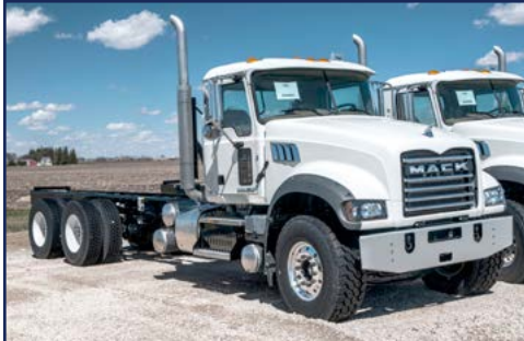
2018 MACK GU713 BridgeKing® Chassis Specs

ALL MIXER PACKAGES AND CHASSIS QUANTITIES CHANGE ON A DAILY BASIS, INVENTORY MAY VARY.