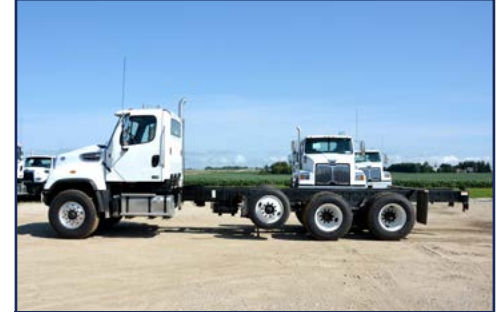
2018 FREIGHTLINER 114SD 11 Yd HP BridgeKing ®

Engine: Detroit DD13-410 Trans: ALL4700RDS Ratio: RT46-140/4.30 Susp: Hendrickson Pusher: Yes W.B: 248" Color: White