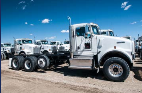
2017 KENWORTH W900 BridgeKing ® Chassis Specs, Roll Stability, Disc

ALL MIXER PACKAGES AND CHASSIS QUANTITIES CHANGE ON A DAILY BASIS, INVENTORY MAY VARY.