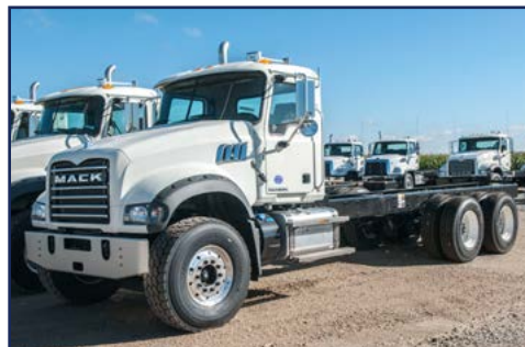
2018 MACK GU713 BridgeKing® Chassis Specs

Engine: MP7-395 Trans: mDrive-14 Ratio: RT46-160/4.10 Susp: HMX Pusher: No W.B: 248" Color: White