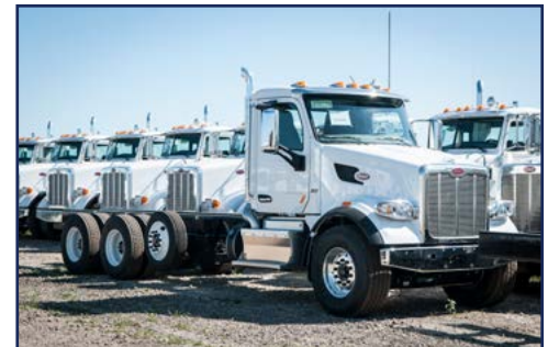
2018 PETERBILT 567 BridgeKing ® Chassis Specs, ESP, AD, EB

Engine: ISX-12/350 Trans: 4500RDS-P 6 Ratio: RT46-160/4.89 Susp: HMX460 Pusher: Yes W.B: 248" Color: White