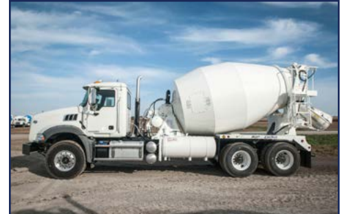
2017 MACK GU813 10.5 Yd HP Extreme Duty

Engine: MP7-405 Trans: 16909ALL Ratio: RT46-160/4.89 Susp: Chalmers Pusher: No W.B: 230" Color: White