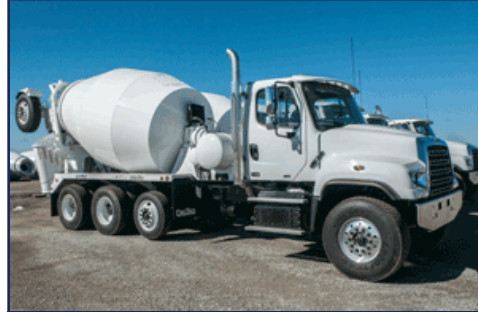
2018 FREIGHTLINER 114SD 11 Yd HP BridgeKing ®

Engine: Detroit DD13-410 Trans: ALL4500RDS Ratio: RT46-140/4.30 Susp: Hendrickson Pusher: Yes W.B: 248" Color: White