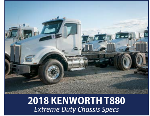
2018 KENWORTH T880 Extreme Duty Chassis Specs

Engine: ISX12-350 Trans: 4500RDS-6 Ratio: RT46-160/4.89 Susp: Chalmers Pusher: No W.B: 236" Color: White