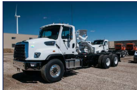
2018 FREIGHTLINER 114SD Extreme Duty Chassis Specs

Engine: Detroit DD13-410 Trans: ALL4500RDS Ratio: RT46-140/4.30 Susp: Hendrickson Pusher: No W.B: 226" Color: White