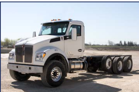
2018 KENWORTH T880S BridgeKing ® Chassis Specs, Alum, Roll, Disc

Engine: ISX12-350 Trans: 4700RDS-7 Ratio: RT46-160/4.89 Susp: Chalmers Pusher: Yes W.B: 248" Color: White