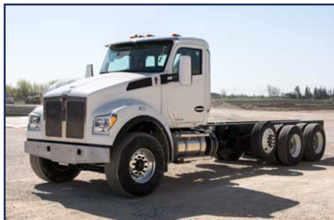
2018 KENWORTH T880S BridgeKing ® Chassis Specs, Jake, Alum

Engine: ISX12-350 Trans: 4500RDS-6 Ratio: RT46-160/4.89 Susp: Chalmers Pusher: Yes W.B: 248" Color: White