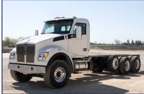
2018 KENWORTH T880S BridgeKing ® Chassis Specs

Engine: ISX12-350 Trans: 14909ALL Ratio: RT46-160/4.89 Susp: Chalmers Pusher: Yes W.B: 248" Color: White