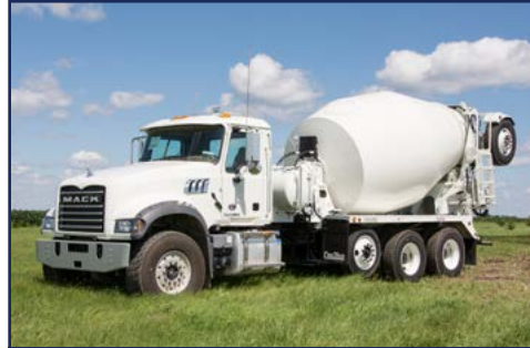
2017 MACK GU713 11 Yd HP BridgeKing®

Engine: MP7-405 Trans: 16909ALL Ratio: RT46-160/4.89 Susp: Chalmers Pusher: NO W.B: 248" Color: White