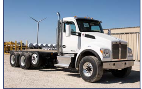
2018 KENWORTH T880S 11 Yd HP BridgeKing ®

Engine: ISX12-350 Trans: 4700RDS-7 Ratio: RT46-160/4.89 Susp: Chalmers Pusher: Yes W.B: 248" Color: White