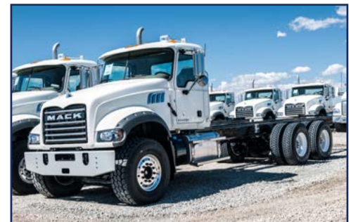
2018 MACK GU713 BridgeKing® Chassis Specs

Engine: MP7-395 Trans: 4500RDS-6 Ratio: RT46-160/4.89 Susp: HMX Pusher: No W.B: 248" Color: White