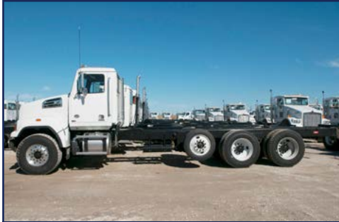
2018 WESTERN STAR 4700SF BridgeKing® Chassis Specs

ALL MIXER PACKAGES AND CHASSIS QUANTITIES CHANGE ON A DAILY BASIS, INVENTORY MAY VARY.