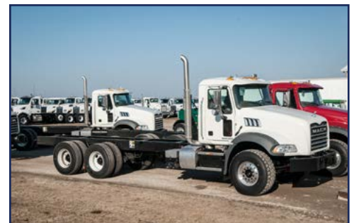
2018 MACK GU813 Extreme Duty Chassis Specs

Engine: MP7-365 Trans: 4500RDS-6 Ratio: RT46-160/4.89 Susp: HMX Pusher: No W.B: 232" Color: White