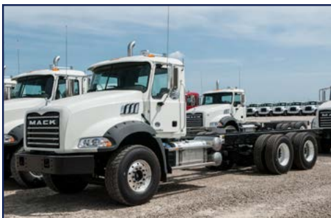
2018 MACK GU813 Extreme Duty Chassis Specs

Engine: MP7-365 Trans: 16909ALL Ratio: RT46-160/4.89 Susp: HMX Pusher: No W.B: 230" Color: White