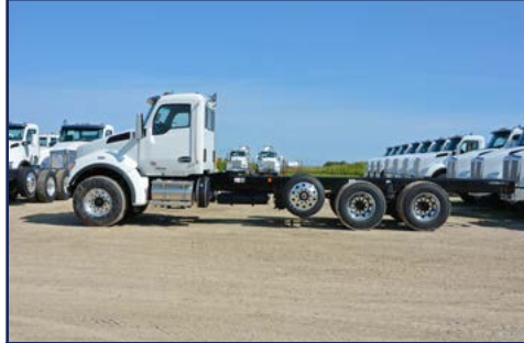
2018 KENWORTH T880S BridgeKing ® Chassis Specs, Jake, Alum

Engine: ISX12-350 Trans: 4700RDS-7 Ratio: RT46-160/4.89 Susp: Chalmers Pusher: Yes W.B: 248" Color: White