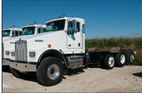
2017 KENWORTH W900 BridgeKing ® Chassis Specs, Roll Stability, Disc

Engine: PX-9 380 Trans: 4500RDS-6 Ratio: MT44-14X5/5.29 Susp: Hendrickson Pusher: Yes W.B: 248" Color: White