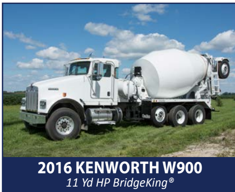
2016 KENWORTH W900 11 Yd HP BridgeKing ®

Engine: MX11-380 Trans: 4500RDS-6 Ratio: RT46-160/4.89 Susp: Chalmers Pusher: Yes W.B: 248" Color: White