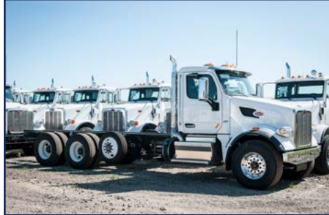
2016 PETERBILT 567 BridgeKing ® Chassis Specs, ESP, AD

Engine: ISX-12/350 Trans: 4500RDS-6 Ratio: D46-170/4.78 Susp: HMX460 Pusher: Yes W.B: 248" Color: White