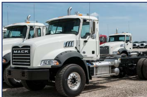
2018 MACK GU813 Extreme Duty Chassis Specs

Engine: MP7-365 Trans: mDrive-14 Ratio: RT46-160/4.10 Susp: HMX Pusher: No W.B: 232" Color: White