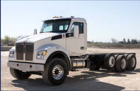
2018 KENWORTH T880S 11 Yd HP BridgeKing ®

ALL MIXER PACKAGES AND CHASSIS QUANTITIES CHANGE ON A DAILY BASIS, INVENTORY MAY VARY.