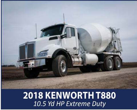
2018 KENWORTH T880 10.5 Yd HP Extreme Duty

ALL MIXER PACKAGES AND CHASSIS QUANTITIES CHANGE ON A DAILY BASIS, INVENTORY MAY VARY.