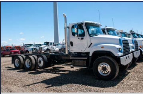
2018 FREIGHTLINER 114SD BridgeKing ® Chassis Specs

VISIT US AT CONCRETEWORKS BOOTH # 529 TO SEE THE UNVAILING OF THE NEXT GENERATION OF MIXER CONTROLS