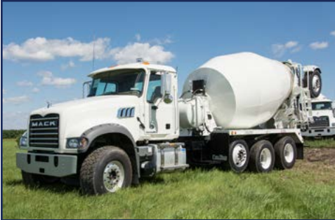
2016 MACK GU713 11 Yd HP BridgeKing®

ALL MIXER PACKAGES AND CHASSIS QUANTITIES CHANGE ON A DAILY BASIS, INVENTORY MAY VARY.