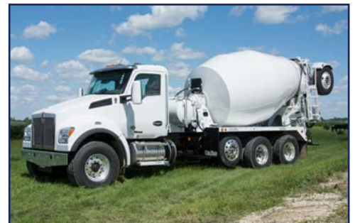
2018 KENWORTH T880S 11 Yd HP BridgeKing ® , Alum

Engine: ISX12-350 Trans: 4700RDS-7 Ratio: RT46-160/4.89 Susp: Chalmers Pusher: Yes W.B: 248" Color: White