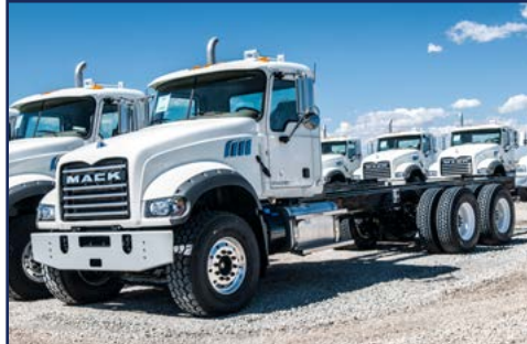
2018 MACK GU713 BridgeKing® Chassis Specs

Engine: MP7-395 Trans: 4500RDS-6 Ratio: RT46-160/4.89 Susp: Chalmers Pusher: No W.B: 248" Color: White