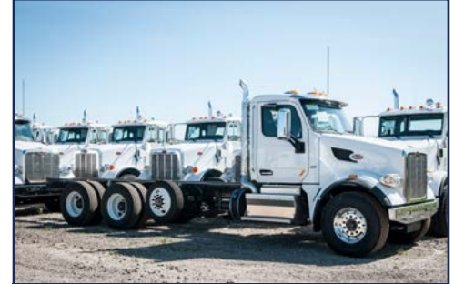
2018 PETERBILT 567 BridgeKing ® Chassis Specs, ESP, EB

Engine: ISX-12/350 Trans: RTO14909ALL Ratio: RT46-160/4.56 Susp: HMX460 Pusher: Yes W.B: 248" Color: White