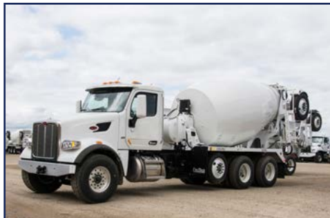
2018 PETERBILT 567 11 Yd HP BridgeKing ® , ESP, AD, EB

Engine: ISX-12/350 Trans: 4700RDS-7 Ratio: RT46-160/4.89 Susp: HMX460 Pusher: Yes W.B: 248" Color: White