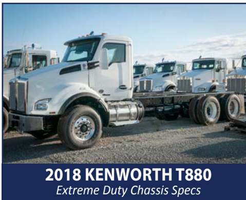
2018 KENWORTH T880 Extreme Duty Chassis Specs

Engine: ISX12-350 Trans: 16909ALL Ratio: RT46-160/4.89 Susp: Chalmers Pusher: No W.B: 228" Color: White