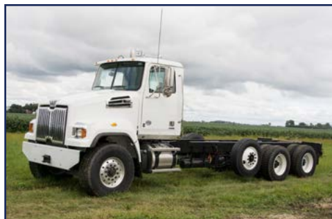
2018 WESTERN STAR 4700SF BridgeKing® Chassis Specs

Engine: DD13-410 Trans: 4700RDS Ratio: RT46-160/4.56 Susp: Hendrickson Pusher: Yes W.B: 248" Color: White