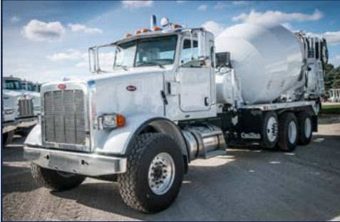
2016 PETERBILT 365 11 Yd HP BridgeKing ®

ALL MIXER PACKAGES AND CHASSIS QUANTITIES CHANGE ON A DAILY BASIS, INVENTORY MAY VARY.