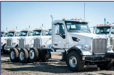
2018 PETERBILT 567 BridgeKing ® Chassis Specs, ESP, EB

Engine: ISX-12/350 Trans: 4500RDS-P 6 Ratio: RT46-160/4.89 Susp: HMX460 Pusher: Yes W.B: 248" Color: White