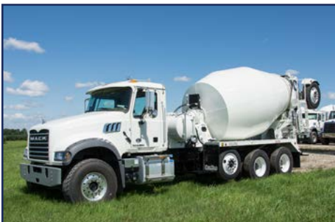
2017 MACK GU713 11 Yd HP BridgeKing®, Roll, Disc

Engine: MP7-405 Trans: 4700RDS Ratio: Mack Susp: HMX Pusher: No W.B: 248" Color: White