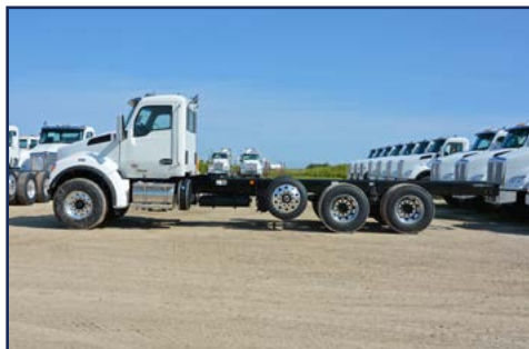
2018 KENWORTH T880S BridgeKing ® Chassis Specs, Alum

Engine: ISX12-350 Trans: 4500RDS-6 Ratio: RT46-160/4.89 Susp: Chalmers Pusher: Yes W.B: 248" Color: White