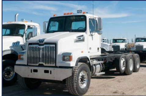
2018 WESTERN STAR 4700SF 11 Yd HP BridgeKing®

Engine: DD13-410 Trans: 4500RDS Ratio: RT46-160/4.56 Susp: Hendrickson Pusher: Yes W.B: 248" Color: White