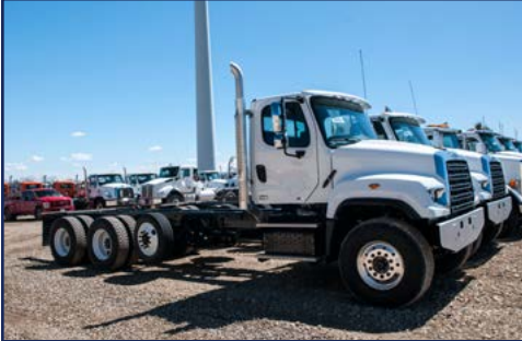
2018 FREIGHTLINER 114SD BridgeKing ® Chassis Specs

ALL MIXER PACKAGES AND CHASSIS QUANTITIES CHANGE ON A DAILY BASIS, INVENTORY MAY VARY.