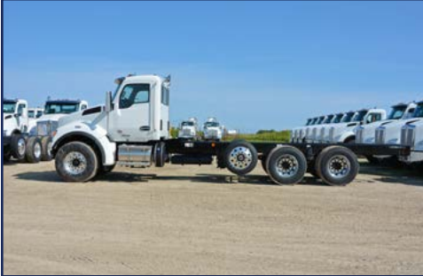
2018 KENWORTH T880S BridgeKing ® Chassis Specs, Alum

ALL MIXER PACKAGES AND CHASSIS QUANTITIES CHANGE ON A DAILY BASIS, INVENTORY MAY VARY.