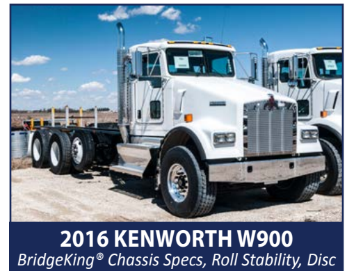
2016 KENWORTH W900 BridgeKing ® Chassis Specs, Roll Stability, Disc

Engine: MX11-380 Trans: 4700RDS-7 Ratio: RT46-160/4.89 Susp: Chalmers Pusher: Yes W.B: 248" Color: White