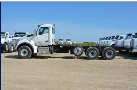
2018 KENWORTH T880S BridgeKing ® Chassis Specs, Alum

Engine: ISX12-350 Trans: 16909ALL Ratio: RT46-160/4.89 Susp: Chalmers Pusher: Yes W.B: 248" Color: White