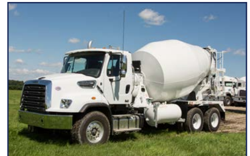
2018 FREIGHTLINER 114SD 10.5 Yd HP Extreme Duty

Engine: Detroit DD13-410 Trans: ALL4500RDS Ratio: RT46-140/4.30 Susp: Hendrickson Pusher: No W.B: 226" Color: White