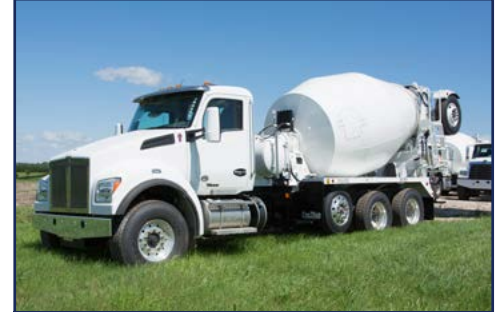
2018 KENWORTH T880S 11 Yd HP BridgeKing ® , Jake, Alum

Engine: ISX12-350 Trans: 4500RDS-6 Ratio: RT46-160/4.89 Susp: Chalmers Pusher: Yes W.B: 248" Color: White